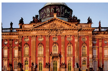
Potsdam | Film Museum

Contact Fon 0049 (0)69 2400 456-0 Fax 0049 (0)69 2400 456-6 Mail summercourses@did.de Web www.did.de