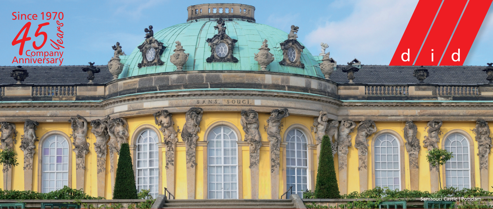
Sanssouci Castle | Potsdam