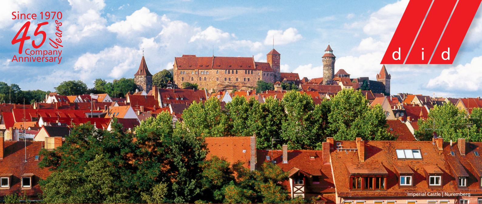
Imperial Castle | Nuremberg