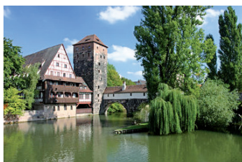
Nuremberg | Weinstadel