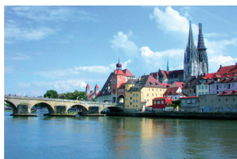
Excursion | Regensburg