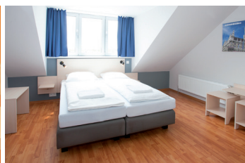
Munich | Room in the residence