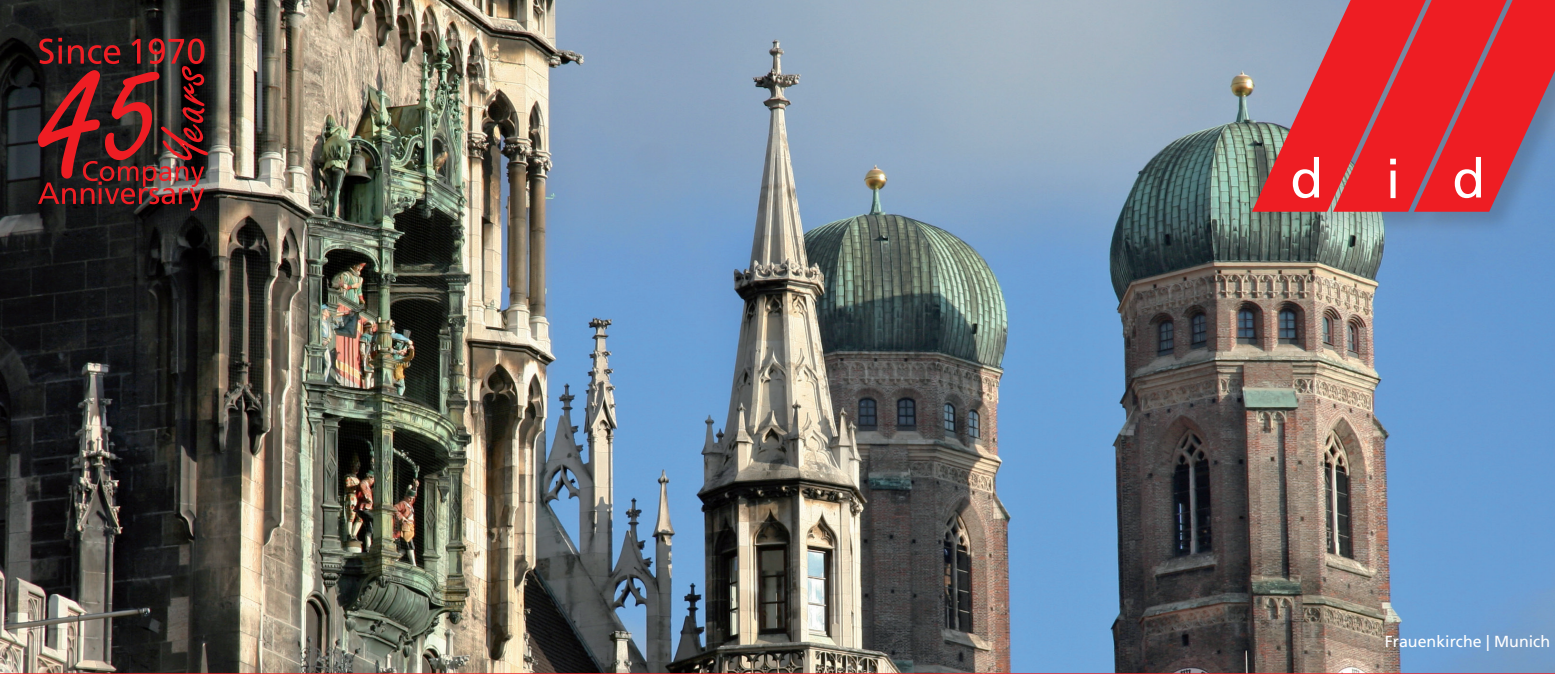
Frauenkirche | Munich