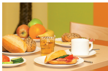
Munich | Breakfast room in the residence