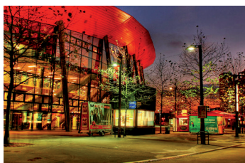
Cologne | Kölnarena venue