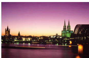
Cologne | City panorama and river Rhine