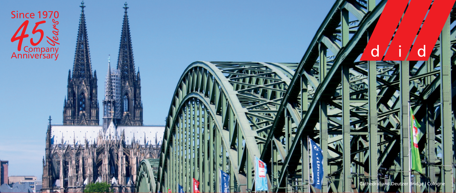
Cathedral and Deutzer Bridge | Cologne